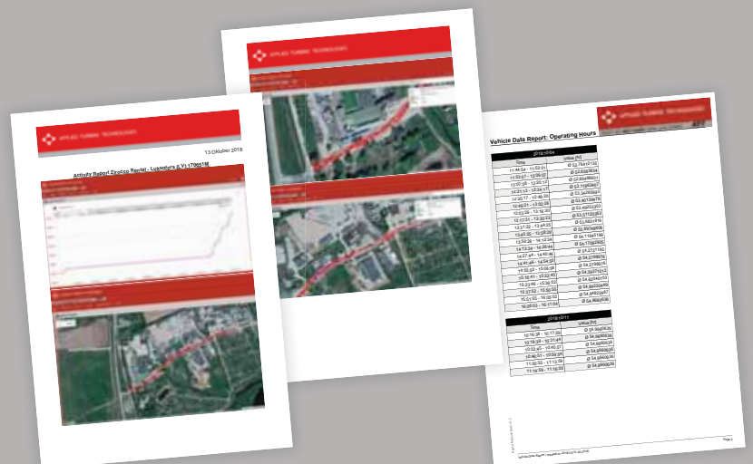
Example pages from report